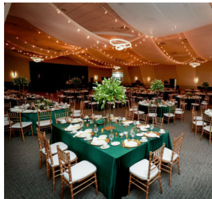
Inwood Oaks Saint Paul