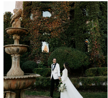
Van Dusen Mansion Minneapolis