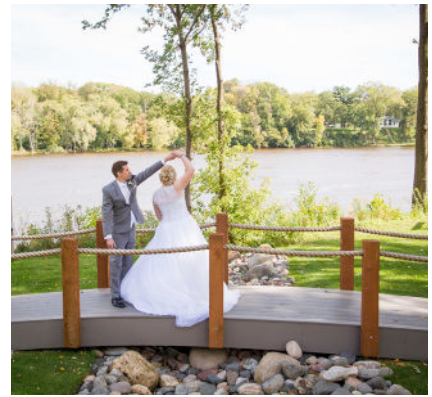
Leopold's Mississippi Gardens Brooklyn Park