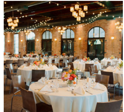
Nicollet Island Pavilion Minneapolis