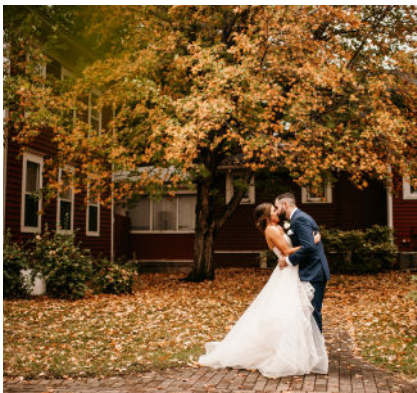
Heritage Center Brooklyn Center